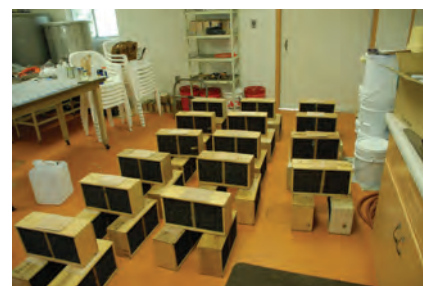
Figure 1. Packages ready to be installed. These packages were received one day prior to their installation into colonies. Consequently, they were stored in a cool (75°F), dark room until they were installed.

the packages are made of screen wire. There is a wooden lid on top of the package. The lid covers a large hole that accommodates a metal feeder can that extends about 3/5 of