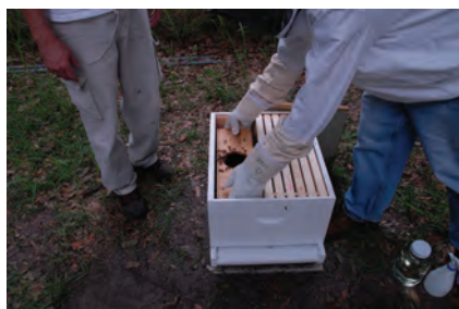
Figure 13. Placing a package into a hive.

Placing the package directly into the hive Step 12 – This step follows step 11 and represents one of two methods for installing the package into the hive. The bee-filled package can be placed into the colony, in the empty space created when the frames are removed (Figure 13). Installing packages this way seems less invasive to the bees than does the second installation method. Furthermore, I find that the bees are less likely to abscond (completely abandon the nest) when installed this way than when shaken into the colony. Let me expand on this idea a bit. I have installed hundreds of packages in my life and occasionally, an entire colony will abscond after installation.