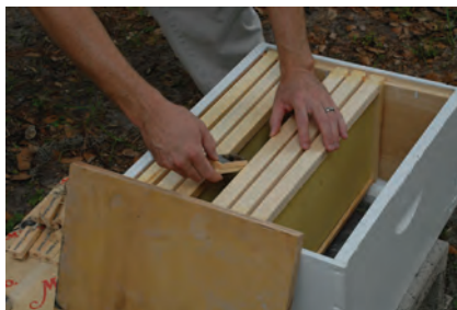
Figure 10. Placing the queen cage into the hive.

Step 10 – Suspend the queen cage between two frames before the bees are added to the colony (Figure 10). The frames in the colony in Figure 10 only have foundation. There are no frames with pulled combs. Thus, the queen cage must be secured between the two frames using the string stapled to the cage.