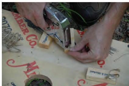
Figure 8. Stapling a string to the back of a wooden queen cage.

Step 8 – Remove the queen cage from the package. Often, the queen cage will have a metal tab or something similar affixed to it so that it can hang on the frame beside which it is installed. If this metal or similar tab is not present, staple a piece string (about 6 inches or 15 cm) to the back of the cage (Figure 8). Make sure the staples are not long enough to go through the cage walls and into the space where the queen and workers are. This could damage the bees within. Also, the string should be sta-