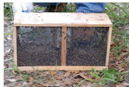
Figure 2. A typical, 3 lb package. The bees have been shaken down to the bottom of the package so that the feeder can is visible.