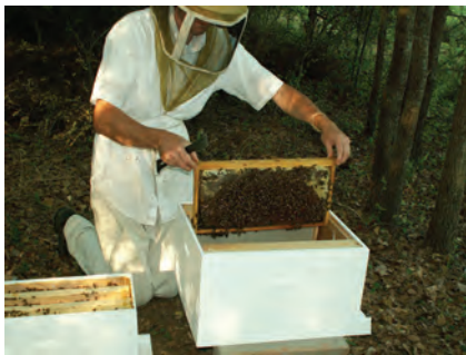
Figure 26. Transferring frames from the nuc into the full size hive.