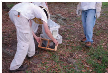
Figure 22. The package can be laid against the hive to allow any remaining bees to exit the package and go into the hive.