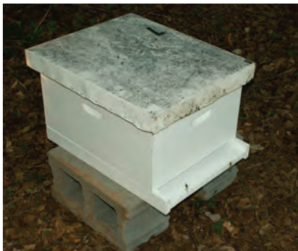
Figure 29. The full size hive after the nuc transfer is complete.

Step 8. Assemble the full size colony (Figure 29).