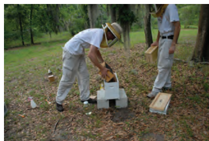
Figure 17. Shaking bees from a package into a nuc.

Step 18 – This step follows step 11 and provides an alternative method of installing packages into hives. It also is the most common way packages are installed into the hive. In this method, the bees in the package (prepared as noted in steps 1-11) are shaken into a hive in the space created when removing the four frames from the hive (Figure 17). To do this, turn the package over the hive and shake it lightly. The misted bees will pour from the hole in the top of the package and into the nest in the empty space created by removing the four frames (Figure 18). After most of the bees have been poured from the package into the hive, the package can be tapped firmly to group the remaining bees into a small cluster that can be poured easily from the package.