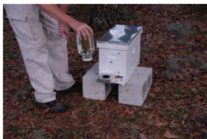
Figure 21. The lid returned to the colony and the feeder jar being added.