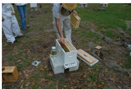
Figure 20. The frames must be returned to the colony slowly in order to reduce the chance that the bees layered on the bottom will be crushed.