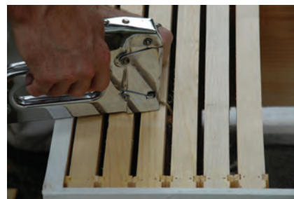
Figure 11. Stapling the string attached to the queen cage to the top of a frame. The cage is affixed about 1/3 of the distance from one end of the frame. That way, it is not in the center of the hive where sugar water can drip onto the cage from jar feeders placed overhead.

Step 11 – Staple the string affixed to the queen cage to the top bar of a frame (Figure 11). This will suspend the queen cage close to the top of the frame. This step is not necessary if the frames between which the cage is installed contain pulled combs. Cages can be secured between two frames containing pulled combs simply by squeezing the frames together and allowing the queen cage to sink into the wax of both combs. Figure 12 shows the correct placement of the queen cage adjacent to a frame. First, the candy end of the cage (the circular chamber containing the solid white candy) is pointing up. This is important, especially when worker bees are in the cage with the queen. Sometimes, the accompanying workers die in the cage and fall to the bottom. If the candy end of the cage points down, the dead worker(s) can block the queen’s exit hole. Second, the screen face of the queen cage