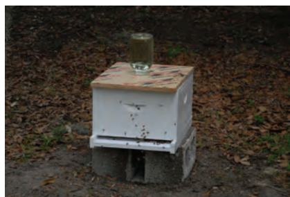
Figure 16. The feeder jar placed on top of the colony.

Step 14 – Provide food to the bees (Figure 16). Most beekeepers and bee educators recommend using a 1:1 mixture of sugar:water, by volume. For example, you could add one quart of water to one quart of sugar, two liters of water to two liters of sugar, etc. Newly installed packages need to be fed as much sugar water as they will take unless a major nectar flow is ongoing. This is especially true if the packages are hived on foundation since the bees will need the incoming energy provided by the sugar to create wax.