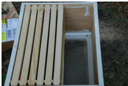
Figure 9. A deep hive body with four frames removed, ready to receive the package of bees.

Step 9 – Remove four frames from the hive (Figure 9). I usually remove the frames from one side of the hive if I am going to install the bees by placing the entire package into the hive. I remove the frames from the middle if I am going to install the bees by shaking the bees from the package and into the hive. Both methods of package installation are discussed below.