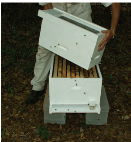
Figure 28. Shaking bees from the nuc hive body into the full size hive.