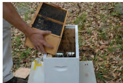
Figure 18. A close-up view of bees being shaken from a package and into a nuc.

Step 19 – Bees will clump together when poured into the bottom of a hive (Figure 19). As a result, the beekeeper must take care not to return the frames too quickly to the hive because they may squish the bees on the bottom of the hive (Figure 20). The frames should be returned to the colony with care to avoid killing bees.