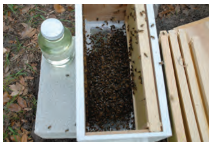
Figure 19. The bees shaken into the hive will form a thick layer on the bottom.

Step 21 – I usually lay the nearly empty package against the hive entrance (Figure 22). This allows any bees that were not shaken from the package to exit the package and enter the nest on their own over the next few days.