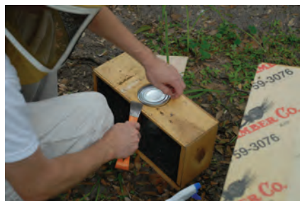
Figure 7. Removing the feeder can using a hive tool.

Step 7 – Remove the feeder from the package using a hive tool (Figure 7) and place the wooden lid loosely over the package opening. The sugar water in the feeder can be added to a hive feeder to feed a colony. Thus, it is useful to have a can opener on hand.