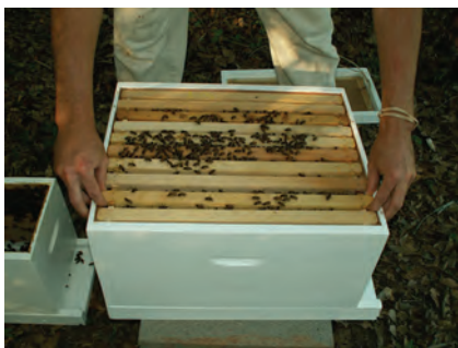
Figure 27. Adjusting the frames in the full size hive now that the transfer of frames from the nuc to the full size hive is complete.