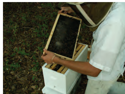
Figure 24. Inspecting the nuc frames for a queen, brood, and general health issues. The bees in this nuc have just begun to construct comb on the black plastic foundation.