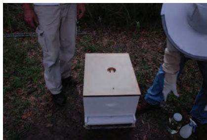
Figure 15. The lid returned to the colony.

Step 13 – Place the lid on the colony (Figure 15).