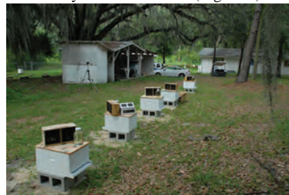
Figure 4. Packages placed on the hives into which they will be installed.

Step 4 – Take the packages to the hives in which they will be installed (Figure 4).