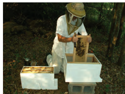
Figure 25. Shaking bees from the nuc inner cover into the full size hive.