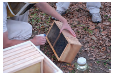
Figure 5. Misting the bees with water.

Step 5 – Spray the packages with water (Figure 5). Bees lightly misted with water cannot fly, making package installation significantly easier. Many people use sugar water for this purpose. However, sugar water makes the package and bees sticky, attracts robbing bees, and is not necessary.