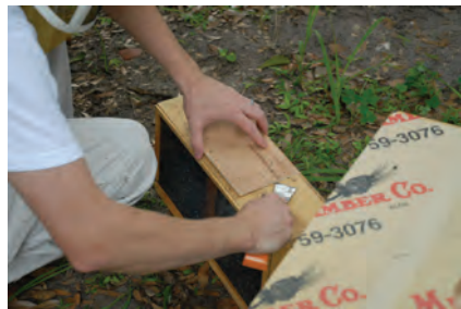
Figure 6. Removing the lid of a package using a hive tool.

Step 6 – Remove the wooden lid from the top of the package using a hive tool (Figure 6). Bees cannot escape the package with the lid removed since the feeder blocks the opening.