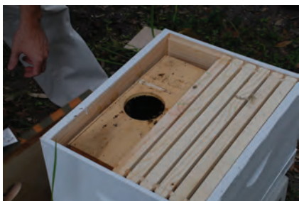
Figure 14. The package is placed to one side of the hive, with the queen cage positioned between the remaining frames, about 1/3 of the distance from one end of the frames.

This can occur for any number of reasons. However, I see it happen most often when the package contains a queen that the package producer overlooked when shaking the bees into the package. The package of bees then initiates a behavior that is similar in nature to swarming but where all of the bees, rather than a fraction of them, leave the hive in search of a new nest. This behavior often can trigger other installed colonies to leave the nest. In fact, I have seen many installed packages merge into super swarms, or one big swarm composed of bees from multiple hives. When installing many packages, I like to (1) install packages late in the evening to give the colony as little daylight as possible to abscond and (2) install the pack-