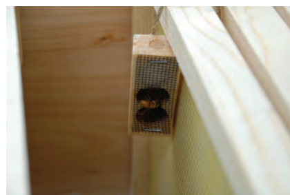
Figure 12. The correct placement of a queen cage in the hive. The candy end of the cage (circular chamber with white solid covered by wax paper) is pointing up and the screened face of the cage runs perpendicular to the face of the comb.

is oriented perpendicular to the face of the comb. Installed this way, the colony’s workers can interact with the queen through the screened face of the cage. The cage’s screen face should not run parallel to the combs between which it is installed. Oriented this way, the bees from the colony are not able to interact with the queen in the cage. Thus, they may not have accepted her by the time she is released. At this point, many beekeepers would remove the cork from the candy end (note the corked hole at the top of the queen cage in Figure 12). Done this way, the worker bees in the colony will eat through the candy in one to three days. However, I like to release my queens from their cages manually, when I can tell that the bees in the colony have accepted them. How do I know if the bees have accepted the queen? Bees usually have accepted the queen if they move freely on the screen face of the cage. The bees in this case can be brushed easily from the cage with one’s finger. Bees that have not accepted the queen tend to cluster tightly on the face of the cage, biting the screen wire. In this instance, it can be difficult to brush the bees from the cage since they are holding on so tightly. It almost appears that the bees are trying, aggressively, to gain access to the queen so that they can attack her.