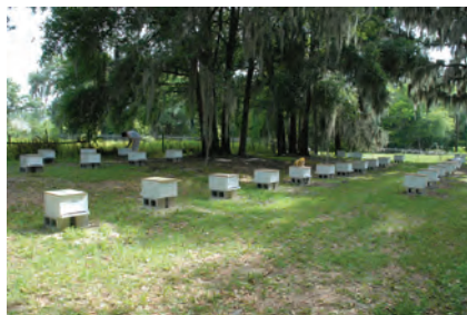
Figure 3. An apiary containing full size, empty hive bodies that are ready to receive packages.

Step 3 – Get your hive components together