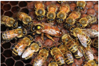
Figure 4 – The retinue of a queen. At least 19 bees can be seen attending the queen in this picture.

Tending the queen (about 3-14 days of age, mean age about 11 days old) -Worker bees tend the queen about the same time period that they perform nurse bee tasks. Workers tending the queen lick her, examine her with their antennae and forelegs, groom her and feed her with glandular secretions and honey (Figure 4). The queen may be fed by workers every 20-30 minutes for about 2-3 minutes per feeding. Worker bees performing this task often form a circle around the queen, with the circling bees being referred to as the queen's attendants or retinue. The licking behavior is quite important. Licking the queen is how the workers acquire and distribute the queen's pheromones around the nest. This spreading of her pheromones maintains nest homeostasis. It lets all workers know she is present.