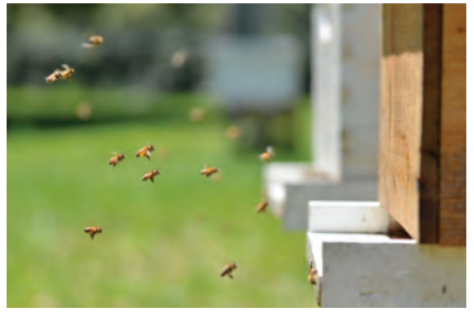
Figure 11 – Worker bees on their orientation flight.

marks (Figure 11). The latter could be trees, bushes, etc. Orientation flights tend to occur on warm, windless, sunny afternoons with the flights lasting about 5 minutes, lengthening in duration and distance from the nest as the number of flights increases. Orienting workers may use these first few flights as opportunities to defecate.