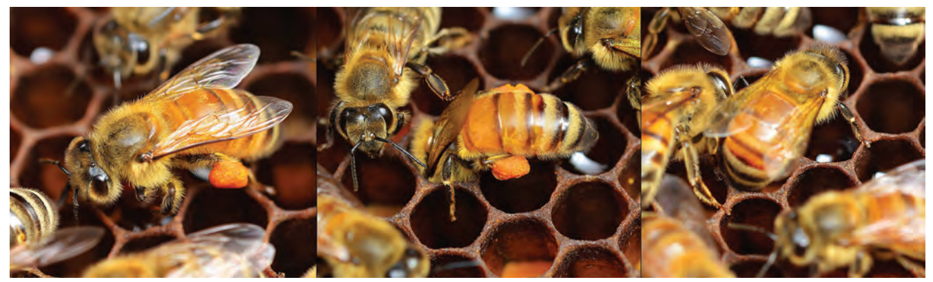
Figure 6 – A worker bee depositing pollen into a cell. The image on the left shows the worker on a comb and laden with pollen. In the middle image, the worker is inspecting a cell to determine if it can receive pollen. The worker decides that it can and positions her hind legs over the cell (right). Using her other legs, she rakes the pollen balls from her legs and into the cell.

Comb building (about 12–23 days of age, mean age about 16 days old) – Workers engaged in this behavior secrete wax scales from the wax plates underneath their abdomens. They grab the wax with their mandibles, shape it, and add it to existing cells or use it to develop new comb in the nest.