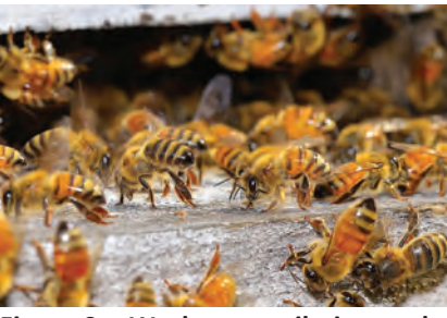
Figure 9 – Workers ventilating at the nest entrance.

Guard duty (about 15-28 days of age, mean age about 19 days old) – Not all worker bees are destined to become guard bees, but many are. Guard bees guard the nest entrance, usually for only a few hours or days before they ultimately progress to foraging-based tasks. Guard bees have a characteristic stance at the nest entrance.