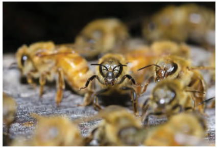
Figure 10 – A worker bee guarding the nest entrance. Notice how the worker's front two legs are in the air and its mandibles are open.

They stand on their back 4 legs with their front legs up in the air and their antennae forward (Figure 10). They employ this behavior in an attempt to keep foreign invaders out of the nest. They smell and touch many of the bees returning from the field, thus deciding who is a nest mate and who should be attacked.