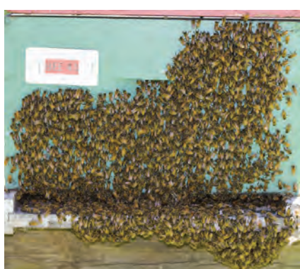
Figure 14 – A colony with a small bee beard. Bee beards can get much larger, with considerably more workers contributing to the formation of the beard.

Defensive response – All worker bees possess the ability to sting nest intruders