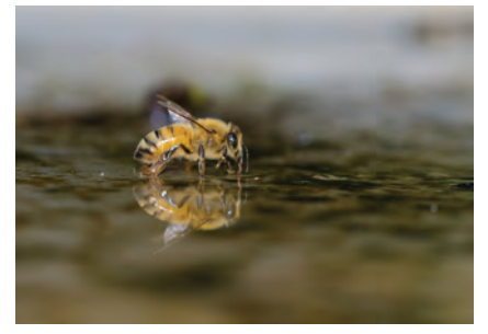
Figure 12 – A worker honey bee collecting water. Notice her reflection in the water.

First foraging flight (about 18-28 days of age, mean age about 24 days old) – Worker bees begin to forage when they are about 3 weeks old. This is the task that the worker bee will die doing. Workers leave the nest to collect water (to cool the nest – Figure 12), pollen (to eat – see Figure 6), nectar (to convert to honey and use as fuel – Figure 13), and plant resins (for propolis). The average worker bee forages only about 4-5 days before dying. They take multiple foraging trips per day and usually die after flying around 500 total miles.