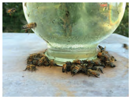
Figure 19 – Worker honey bees robbing the sugar water from a hive top feeder.

the lid, in the hive entrance, etc. (Figure 19). This behavior appears quite costly to the robbing worker as she often loses all of her hair, develops tattered wings, etc. Regardless, it must be worth doing given how common the behavior is and how it can escalate quickly during periods of nectar dearth.