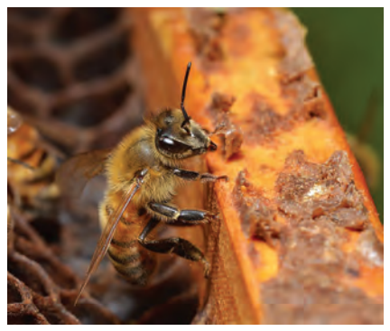
Figure 18 – A resting worker bee.

the lid, in the hive entrance, etc. (Figure 19). This behavior appears quite costly to the robbing worker as she often loses all of her hair, develops tattered wings, etc. Regardless, it must be worth doing given how common the behavior is and how it can escalate quickly during periods of nectar dearth.