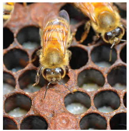
Figure 2 – A worker capping a brood cell. Notice that the cell the worker's head is over is partially capped.

Capping brood (about 3-10 days of age, mean age about 8 days old) – Young worker bees are able to secrete wax in small amounts. This allows them to cap the cells of larvae that are ready to begin transforming into pupae (Figure 2). They also may seal cells of ripe honey while at this age. A cell can take 20 minutes to 6 hours to cap.