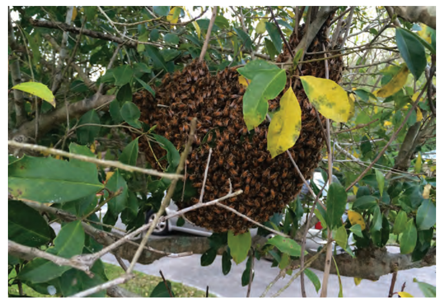
Figure 4. A swarm of bees clustered in a tree. This small cluster is only about the size of a basketball and may contain around 10,000 bees.

Scout bees leave the surface of the swarm cluster to search for potential nest sites. When a scout bee finds such a site, she spends about 45 mins going in and out of the cavity, making numerous internal visits. The bee is trying to gather information about the potential nest site. She walks the internal