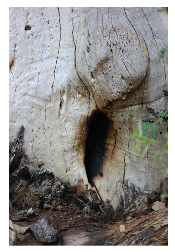
Figure 6. An opening leading to a potential nest site in a tree. Photograph University of Florida.