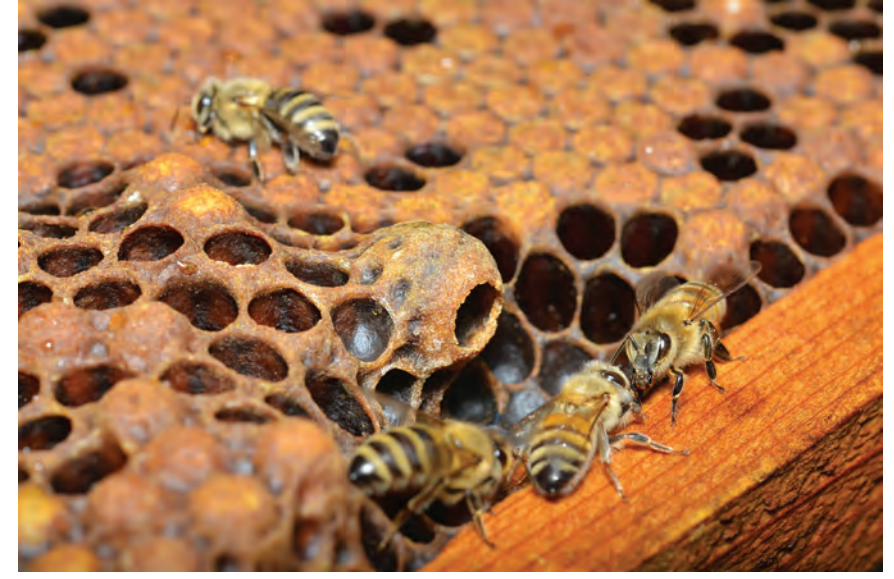
Figure 1. A queen cup. The comb on which the queen cup has been built is leaning back to the left. In its proper orientation, the opening of the queen cup would be pointing down.

This part of swarm biology is quite interesting as a number of questions regarding the necessity of swarm clusters arrive. For example, why do bees need to form a cluster during the swarm process? Why can they not simply choose their new nest site while still in their original nest and then fly straight to the nest site when they swarm? The answers to these questions are not fully