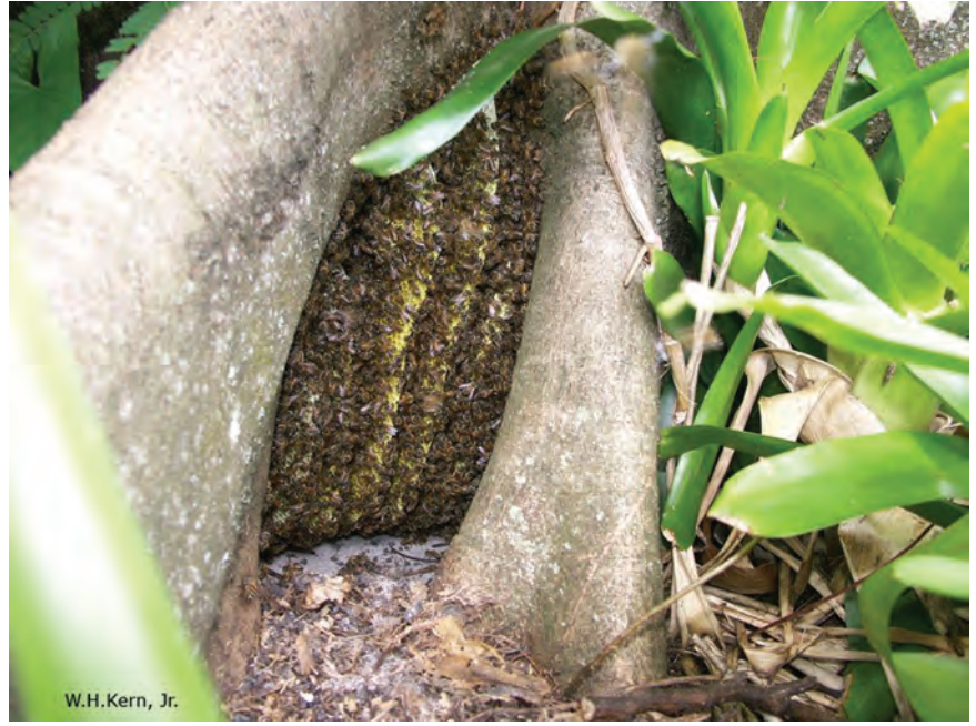
Figure 7. A less-than-ideal nesting site. These bees, which happen to be African honey bees in southern Florida, chose a less-than-ideal nest site. Though they are nesting in a tree, the nest is close to the ground and contains a very large entrance. It likely was the best of the available nesting sites.