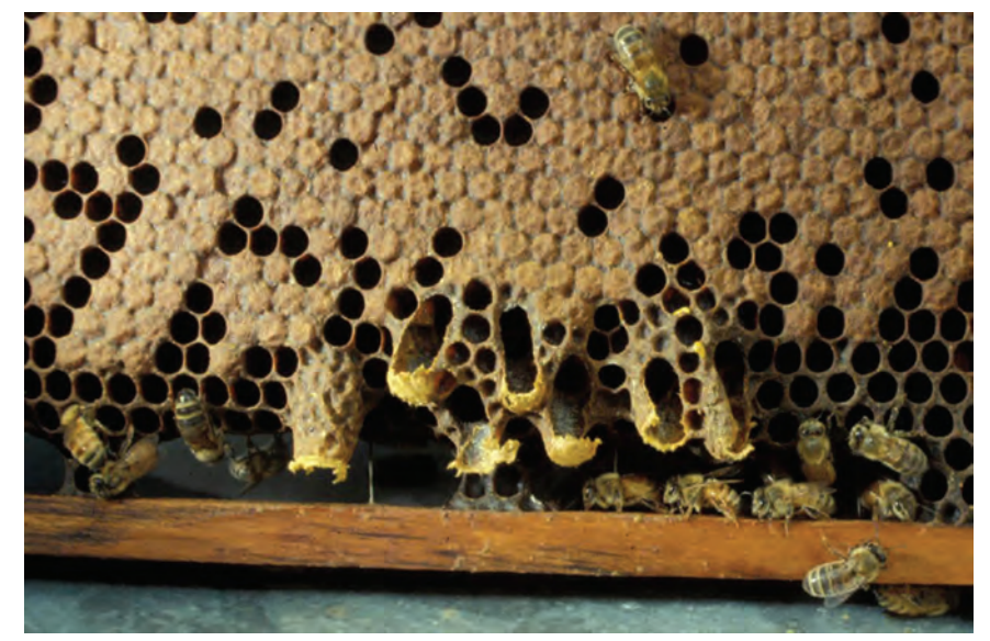
Figure 5. Swarm cells at the bottom of a frame. A virgin queen emerged correctly from the cell on the left (the tip of the cell is open) and killed her sisters while they were developing in the cells (the queen cells were opened from their sides). These cells suggest that the swarm has happened already and that the colony will not swarm again. How can this be known? The placement of the queen cells on the perimeter of the brood comb suggests that they are swarm cells rather than supersedure cells. The fact that one is opened from the tip suggests a virgin queen has emerged and replaced the swarming mother queen. Swarm cells opened from the side suggest that the virgin queen is not going to swarm with a secondary swarm given that no replacement queens for her remain alive.

It only takes the swarm about 60 seconds to diffuse from its holding pattern, the cluster, and begin to fly to its new home once the best site is identified. How this happens is quite interesting. Only the scout bees that were looking and dancing for a nest site are warm enough to fly (bees must warm their flight muscles before they are able to fly). These bees will trigger the warming up of the other bees by pushing their thoraces onto cool bees and emitting a vibration that can be heard as a piping noise. This lasts 0.5 - 1 second. Essentially, the piping scout bees are telling the other bees to "warm up, it is time to leave." At some point, the scout