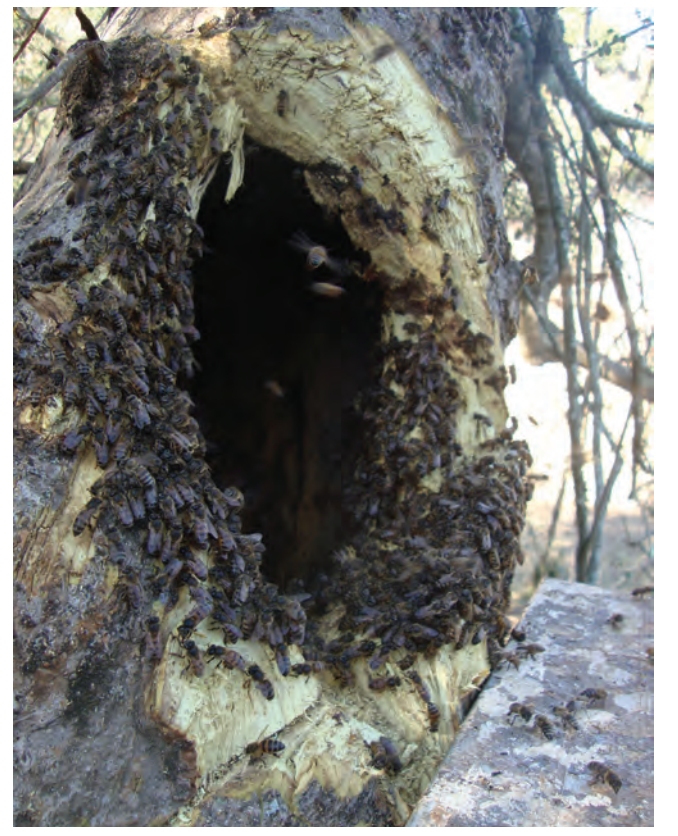
Figure 8. Honey bees at the entrance of a newly occupied nest. This colony of bees recently moved into this nest – notice how no comb can be seen in the nest cavity.

The resulting cloud of swarming bees is a site to behold. The cloud usually is about 30 feet long, 20 feet wide, and about 10 or so feet high. The bees moving at the bottom of the cloud fly only slightly over human head level, flying at a maximum of about 6 miles