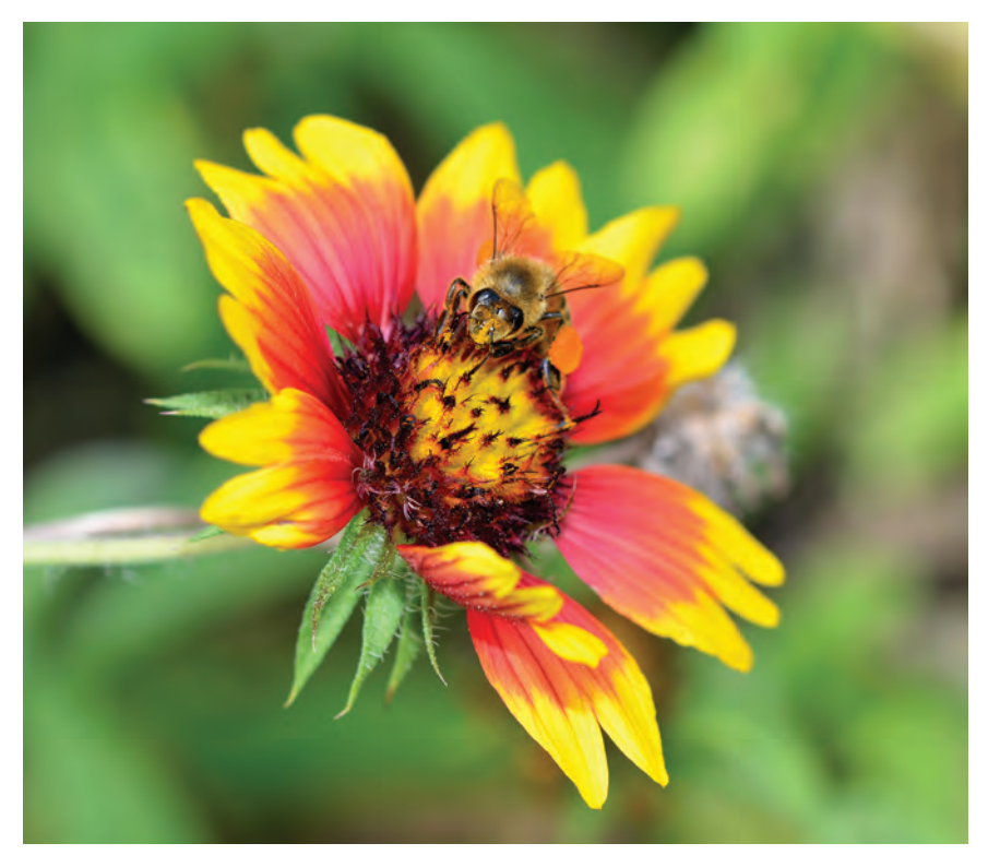
Figure 6. A honey bee collecting pollen from a flower will return to the nest and tell her sisters where her goods were collected.

49 feet) and a waggle dance for resources >100 m (328 feet) from the nest. Obviously, one, then, is left to wonder how bees communicate information about resources between 15 - 100 m (49 – 328 feet) from the nest. The answer is that at distances greater than 15 m (49 feet), the dance pattern begins to morph from that of the circle to that of the waggle relatively linearly as the distance increases up to about 100 m (328 feet). Ap-