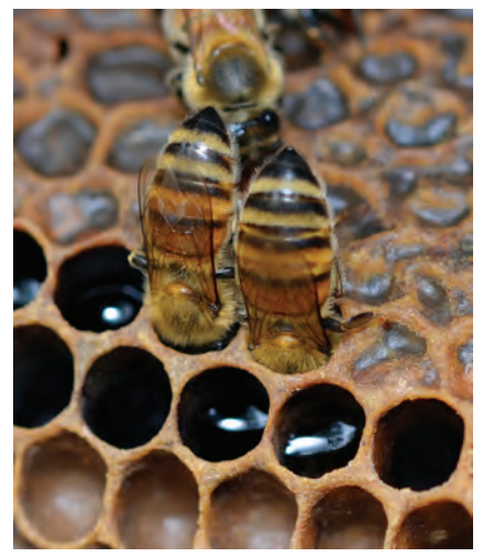
Figure 8. These two bees are receiver bees. They have offloaded nectar from returning foragers and now are depositing it into wax cells.

4) A final dance, the tremble dance, is also an important regulator of colony foraging behavior. Foragers returning from the field want to offload their contents to receiver bees (Figure 8) so that they can return to the field to collect more resources. However, there are times when they return to the nest and are unable to find bees to relieve them of their resources. When it takes longer than about 50 seconds to find a receiver bee, the foragers will walk slowly around the nest, making trembling motions forward/backward, right/left, etc. while rotating their bodies to face different directions. About 3 -4 times per minute, the bee performing the tremble dance will lunge forward and head butt another bee, using her flight muscles to generate a high pitched sound. This behavior seems to cause the buzzed bees to become receiver bees, thus allowing the foraging efforts of the colony to ramp up given that receiver bees are ready to offload the heavily laden foragers. In general, bees returning from a good nectar source will perform tremble dances if it takes longer than 50 second to offload their nectar and waggle dances if it takes them less than 20 seconds (telling them that there is an ample supply of receiver bees ready to handle an influx of quality resources). Seeley (1995) says: