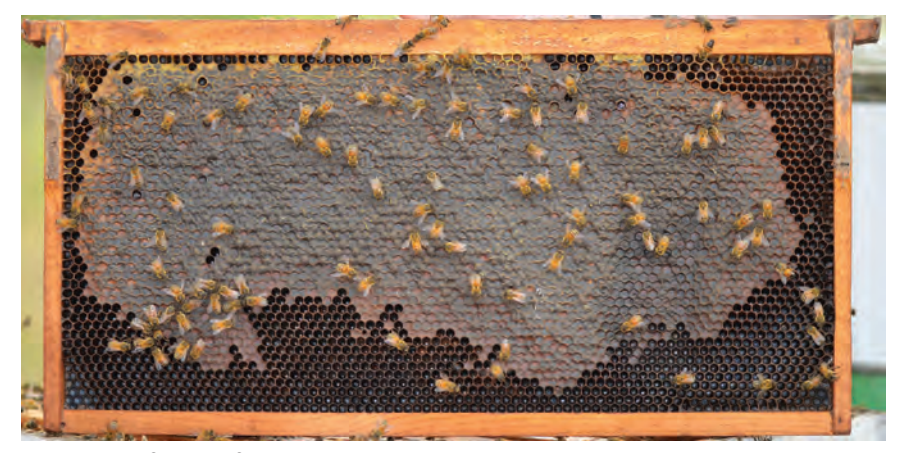
Figure 1. A frame of honey. Honey is a good colony insulator. It usually is stored around and above the brood.

The second way that bees warm the nest is by initiating and maintaining a colony cluster. A cluster of bees, sometimes called