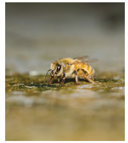
Figure 3. A forager bee collecting water. Water foragers will return to the hive and offload their cargo to a receiver bee. The droplets of water are placed on combs in the brood area and help cool the colony as they are evaporated.

Water collection by bees is under a fairly tight regulation. Bees normally collect water from spring to fall to dilute honey, make brood food, etc. There are almost al-