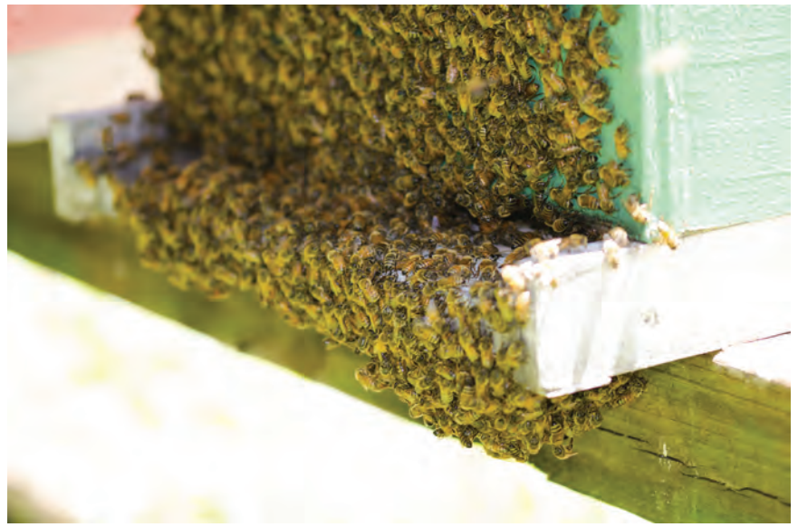
Figure 4. Bees bearding on the front of a honey bee colony. These bees have left the nest on a warm summer evening so that the nest can cool. This site alarms many new beekeepers, but it is a normal part of bee biology. Photograph: Mike Bentley.

ways bees foraging for water, even if only a few bees. So, the colony needs to know to increase water collection somehow and this is regulated by an event that happens upon the return of the water forager from the field. As noted, returning water foragers need to offload their cargo to a receiver bee. The time it takes water foragers to find receiver bees dictates the urgency with which a colony will forage for water. If returning water foragers find a receiver bee quickly, they will continue to hunt for water and perform water foraging recruitment dances, thus recruiting more workers to the job. If it takes a while to unload the water, their propensity to collect more water and dance to recruit more water foragers will decrease. Thus, colonies upregulate water collection, in part, by having more receiver bees ready to offload water from the water foragers as this signals to the foragers that the colony needs more water. Since water evaporation is so important for cooling the nest, colonies often have a greater difficulty keeping nests cool on hot nights, when they cannot forage for water, than during the day, when they can.