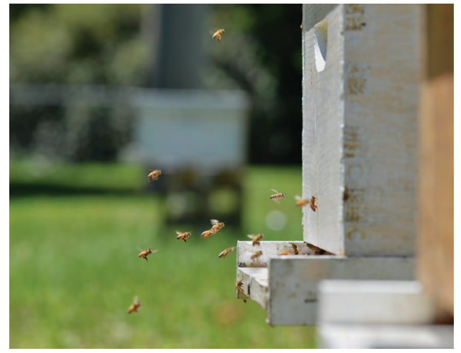
Figure 5. Foraging honey bees returning to their hive laden with the bounty from their hard work.

Both scout and employed recruit bees dance to attract unemployed recruits to sites that they are visiting. The only difference is that scout bees are conveying new information about a newly discovered site while the employed bees, that, themselves, were once recruited to a forage site, are updating information made about previous findings. Both types of bees are conveying useful information. The scout is telling the colony where the next big thing is while the employed recruit tells about the quality of an existing site and communicates the site's decline over time. Only unemployed foragers, the true recruits, receive information through dances. They are the ones whose attention the dancing foragers are trying to get.