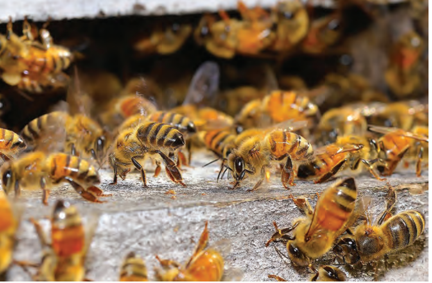
Figure 2. Ventilating bees. These bees stand at the nest entrance, face the entrance, tilt the tip of their abdomen slightly down, and fan their wings. This fanning helps move warm air out of the colony, thus cooling the nest.

Colonies are in danger of overheating in warmer locations and during warm times of the year. Not surprisingly, honey bees have a way of dealing with this as well. Bees want to keep the nest below a certain temperature for a few reasons. First, brood will die or will develop poorly at temperature extremes above 36°C (96.8°F). Because bee activity generates heat, ambient temperatures above 30°C (86°F) put the colony at great risk from itself given that the temperature can rise quickly on a hot day. Second, beeswax combs will soften and collapse under their own weight when nest temperatures are above 40°C (104°F). Third, adult bees can survive only a few hours at temperatures between 45 - 50°C (113 - 122°F). They seem to have a lower tolerance to high heat than they do to cool temperatures. Despite this, bees seem to be really good at keeping the